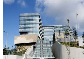
Photo: Lee Shau Kee Business Building